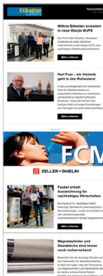
Weekly Newsletters Special Newsletters Stand-Alone Newsletter White Papers