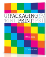
Special publications – related to special topics and companies